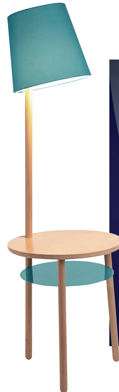
BY MICHELE KOH MOROLLO

Created by Pauline Gilain and Pierre-François Dubois for Parisian design studio Harto, the Table Lamo Josette is both a light source and a side table. Ideal as nightstands and illumination for reading nooks, this space-saving lamp gives you a surface to rest your books or place a cup of tea. Put it next to your favourite armchair in a cosy corner to create a perfect reading nook.